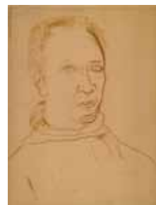
Beauford Delaney (Knoxville 1901-1979 Paris), Self Portrait , circa 1963. Crayon on paper, 19 3/4 x 25 3/4 inches. Knoxville Museum of Art, purchase with funds provided by the Rachael Patterson Young Art Acquisition Reserve.