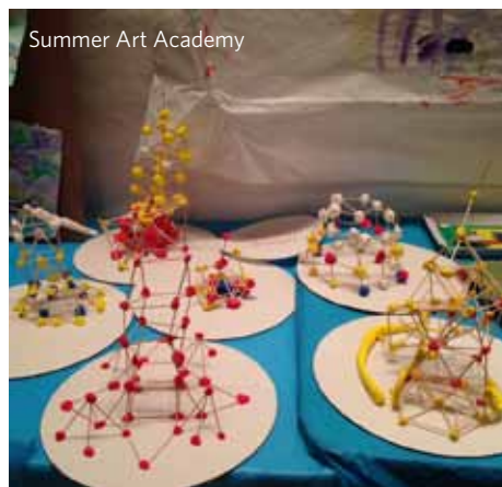
Summer Art Academy