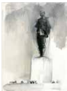
Zsolt Bodoni (Alesd, Romania 1975; lives and works in Budapest, Hungary), Stalin (small) , 2009. Acrylic on canvas, 15 3/4 x 12 inches. Knoxville Museum of Art, gift of David Hoberman.