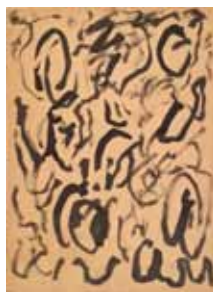
Beauford Delaney (Knoxville 1901-1979 Paris), Untitled , late 1950s. Ink on paper, 12 x 8 3/4 inches. Knoxville Museum of Art, purchase with funds provided by the Rachael Patterson Young Art Acquisition Reserve.