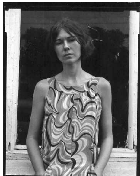
Danny Lyon, Leslie, Knoxville 1967, 1967

ples of contemporary art in other media. As in previous years, the museum's temporary exhibitions explored aspects of East Tennessee's regional artistic legacy and its connections to national and international currents and, in an exceptional way this year, helped the KMA build its collection. This World Is Not My Home: Danny Lyon Photographs , an exhibition of 50 works organized by The Menil Collection, Houston, presented the influential street photographer's career from 1962 to the present. Lyon spent time with and documented a notorious Chicago biker gang, civil rights demonstrations, and death row inmates in Texas. A special group of nearly 30 photographs taken during a visit to Knoxville in 1967 was featured in the KMA's presentation and, thanks to the generosity of the artist and several dozen donors, has been acquired by the KMA. Another opportunity for a significant acquisition was provided by LIFT: Contemporary Printmaking in the Third Dimension , organized by the KMA with support from the National Endowment for the Arts and in collaboration with the Printmaking Program of the UT School of Art. This dazzling and innovative exhibition presented the work of internationally-acclaimed contemporary artists who use a variety of strategies to bring a sculptural dimension to printmaking. The KMA Collectors Circle funded the acquisition of an impor-