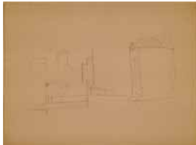
Beauford Delaney (Knoxville 1901-1979 Paris), Untitled , late 1940s. Pencil on paper, 9 1/2 x 12 1/2 inches. Knoxville Museum of Art, purchase with funds provided by the Rachael Patterson Young Art Acquisition Reserve.