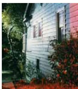
Geoffrey Aronson (New London, Connecticut 1950; lives and works in Valladolid, Yucatan, Mexico) N. Highland Avenue (Atlanta) , 2004. C-print on Kodak paper, 16 x 14 inches (approximate). Knoxville Museum of Art, gift of the artist.