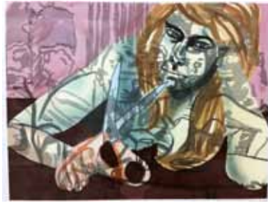
David Salle (Norman, Oklahoma 1952; lives and works in Brooklyn), Portrait with Scissors and Nightclub , 1987. Color woodblock print on paper, 2/100, 24 3/4 x 29 inches. Knoxville Museum of Art, bequest of Arlene Goldstone.