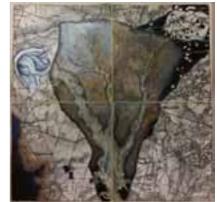
Marcia Goldenstein (Lincoln, Nebraska 1948; lives and works in Knoxville), Tree Map , 2005. Mixed media on antique maps, 10 3/8 x 10 1/2 inches. Knoxville Museum of Art, bequest of Arlene Goldstine.