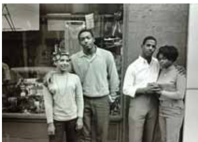
Danny Lyon (Brooklyn, 1942; lives and works in New York), Untitled , Knoxville, 1967. Gelatin silver print, 11 x 14 inches. Knoxville Museum of Art, gift of the artist.