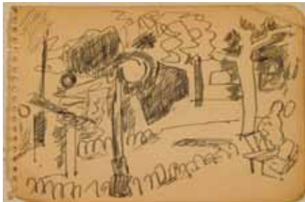
Beauford Delaney (Knoxville 1901-1979 Paris), Untitled (Park Scene) , 1940s. Ink on spiral notebook paper, 4 1/8 x 7 inches. Knoxville Museum of Art, purchase with funds provided by the Rachael Patterson Young Art Acquisition Reserve.