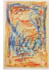
Beauford Delaney (Knoxville 1901-1979 Paris), Untitled (Tuileries, France) , circa 1966. Pastel on paper, 7 1/2 x 5 inches. Knoxville Museum of Art, purchase with funds provided by the Rachael Patterson Young Art Acquisition Reserve.