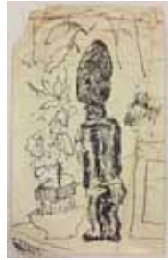
Beauford Delaney (Knoxville 1901-1979 Paris), Untitled (West African Figurine) , early 1960s. Ink on foil wrapper, 6 1/2 x 4 inches. Knoxville Museum of Art, purchase with funds provided by the Rachael Patterson Young Art Acquisition Reserve.