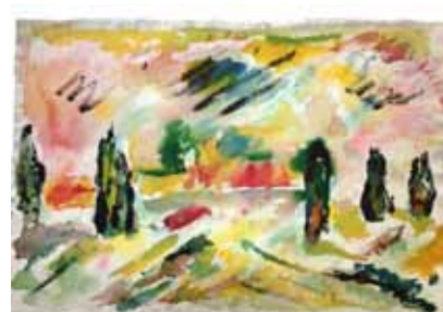
Beauford Delaney (Knoxville 1901-1979 Paris), Untitled (Landscape) , 1940s. Watercolor on paper, 15 1/4 x 22 1/2 inches. Knoxville Museum of Art, purchase with funds provided by the Rachael Patterson Young Art Acquisition Reserve.