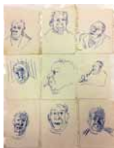
Beauford Delaney (Knoxville 1901-1979 Paris), Untitled (Self-portrait Studies) , late 1950s. Ink on 9 spiral notebook pages, 5 1/2 x 4 1/2 inches each. Knoxville Museum of Art, purchase with funds provided by the Rachael Patterson Young Art Acquisition Reserve.