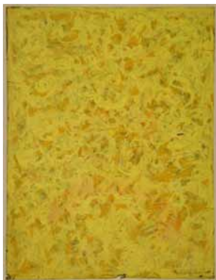
Beauford Delaney, Untitled , 1960

The history of its reception at UT—the mural was hidden for years because of its portrayal of African-Americans made it a target of controversy—tells us a great deal about our history as a community and keeps open an important and sometimes difficult conversation about race and our connections to one another.