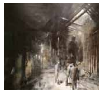
Zsolt Bodoni (Alesd, Romania 1975; lives and works in Budapest, Hungary), Replaced , 2009. Acrylic on canvas, 71 x 78 3/4 inches. Knoxville Museum of Art, gift of David Hoberman.