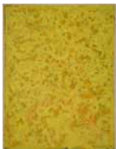
Beauford Delaney (Knoxville 1901-1979 Paris), Untitled , 1960. Watercolor and gouache on paper, 25 1/2 x 19 1/2 inches. Knoxville Museum of Art, purchase with funds provided by the Rachael Patterson Young Art Acquisition Reserve.