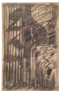
Beauford Delaney (Knoxville 1901-1979 Paris), Untitled (Abstraction) , 1953. Charcoal and chalk on paper, 16 3/4 x 10 3/4 inches. Knoxville Museum of Art, purchase with funds provided by the Rachael Patterson Young Art Acquisition Reserve.