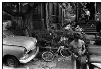
Danny Lyon (Brooklyn, 1942; lives and works in New York), Untitled (Don) , Knoxville, 1967. Gelatin silver print, 11 x 14 inches. Knoxville Museum of Art, purchase.