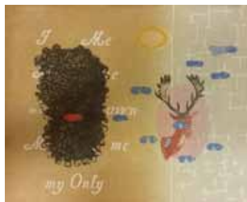
Pam Longobardi (Glen Ridge, New Jersey 1958; lives and works in Atlanta, Georgia), Animal/Beautiful , 1998. Color woodblock with intaglio and chine colle, edition of 23, 11 3/16 x 14 inches. Knoxville Museum of Art, bequest of Arlene Goldstine.