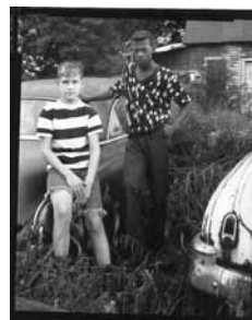
Danny Lyon (Brooklyn, 1942; lives and works in New York), Untitled, Knoxville, 1967 . Gelatin silver print, 14 x 11 inches. Knoxville Museum of Art, purchase with funds provided by Sheena McCall.