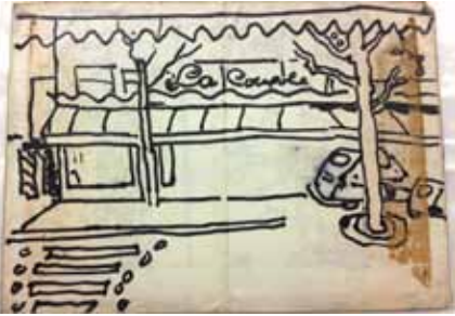
Beauford Delaney (Knoxville 1901-1979 Paris), Untitled (La Coupole) , early 1960s. Ink on paper, 9 x 6 inches. Knoxville Museum of Art, purchase with funds provided by the Rachael Patterson Young Art Acquisition Reserve.