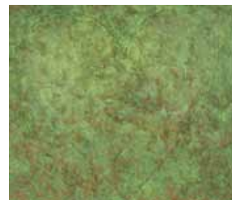
Jim Dine (Cincinnati 1935; lives and works in New York) Green Picture in My Meadow , 1971. Acrylic and straw on canvas, 72 1/4 x 84 1/4 inches (78 x 90 inches framed). Knoxville Museum of Art, gift of June and Rob Heller.