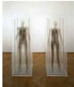
Marilène Oliver (London, England 1977; lives and works in Rio de Janeiro, Brazil), Family Portrait (Mum and Dad) , 2003. Bronze ink screen printed on acrylic sheets, edition 4/6, 75 1/2 x 27 x 19 3/8 inches each. Knoxville Museum of Art, purchase with funds provided by the KMA Collectors Circle and partial gift of the artist.