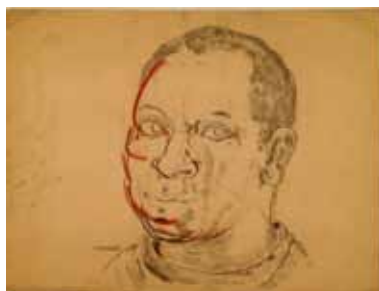
Beauford Delaney (Knoxville 1901-1979 Paris), Self Portrait , 1963. Charcoal and pastel on paper, 14 1/4 x 18 3/4 inches. Knoxville Museum of Art, purchase with funds provided by the Rachael Patterson Young Art Acquisition Reserve.