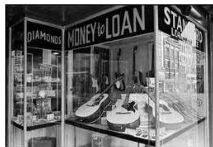
Danny Lyon (Brooklyn, 1942; lives and works in New York), Gay Street , Knoxville, 1967. Gelatin silver print, 11 x 14 inches. Knoxville Museum of Art, purchase.