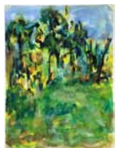
Beauford Delaney (Knoxville 1901-1979 Paris), Untitled (Knoxville) , 1969. Watercolor on paper, 12 1/2 x 9 1/2 inches. Knoxville Museum of Art, purchase with funds provided by the Rachael Patterson Young Art Acquisition Reserve.