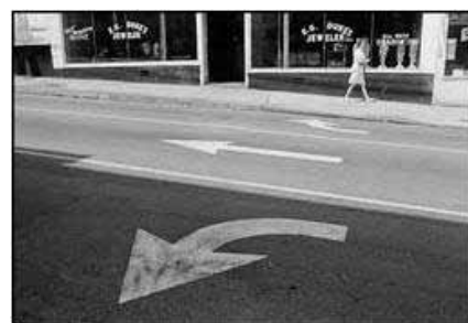
Danny Lyon (Brooklyn, 1942; lives and works in New York), Sunday , Knoxville, 1967. Gelatin silver print, 11 x 14 inches. Knoxville Museum of Art, purchase.