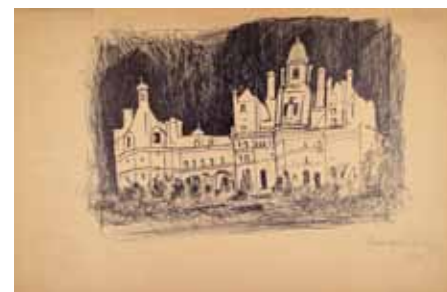
Beauford Delaney (Knoxville 1901-1979 Paris), Untitled , 1971. Ink on paper, 15 1/2 x 23 1/2 inches. Knoxville Museum of Art, purchase with funds provided by the Rachael Patterson Young Art Acquisition Reserve.