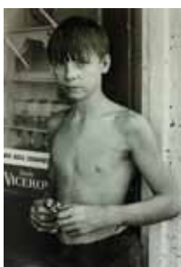
Danny Lyon (Brooklyn, 1942; lives and works in New York), Untitled , Knoxville, 1967. Gelatin silver print, 14 x 11 inches. Knoxville Museum of Art, gift of the artist.