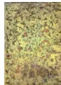
Beauford Delaney (Knoxville 1901-1979 Paris), Untitled , 1960. Watercolor, gouache, and sand on paper, 27 1/2 x 19 1/2 inches. Knoxville Museum of Art, purchase with funds provided by the Rachael Patterson Young Art Acquisition Reserve.