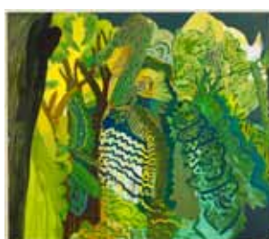
Karla Wozniak, Synchronous Fireflies , 2014