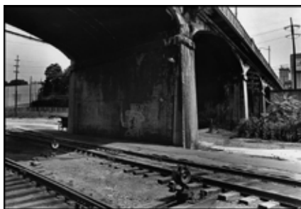
Danny Lyon (Brooklyn, 1942; lives and works in New York), Untitled (11 th Street Viaduct) , Knoxville, 1967. Gelatin silver print, 11 x 14 inches. Knoxville Museum of Art, purchase.