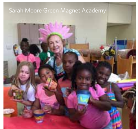
Sarah Moore Green Magnet Academy