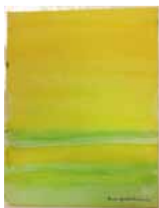
Beauford Delaney (Knoxville 1901-1979 Paris), Untitled , 1960s. Watercolor on paper, 8 1/2 x 6 1/2 inches. Knoxville Museum of Art, purchase with funds provided by the Rachael Patterson Young Art Acquisition Reserve.