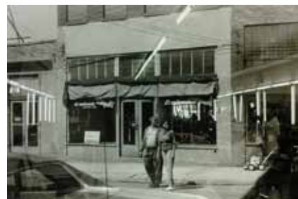
Danny Lyon (Brooklyn, 1942; lives and works in New York), Untitled , Knoxville, 1967. Gelatin silver print, 11 x 14 inches. Knoxville Museum of Art, gift of the artist.