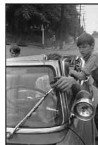
Danny Lyon (Brooklyn, 1942; lives and works in New York), Untitled, Knoxville, 1967 . Gelatin silver print, 14 x 11 inches. Knoxville Museum of Art, purchase.