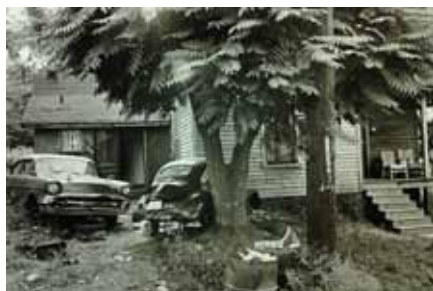
Danny Lyon (Brooklyn, 1942; lives and works in New York), Untitled , Knoxville, 1967. Gelatin silver print, 11 x 14 inches. Knoxville Museum of Art, gift of the artist.