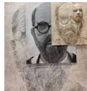
Jonathan Santlofer (New York 1946; lives and works in New York), Chuck (Close) , 1994-95. Oil, pencil, encaustic, plaster on wood, 48 x 44 x 6 inches. Knoxville Museum of Art, bequest of Arlene Goldstine.