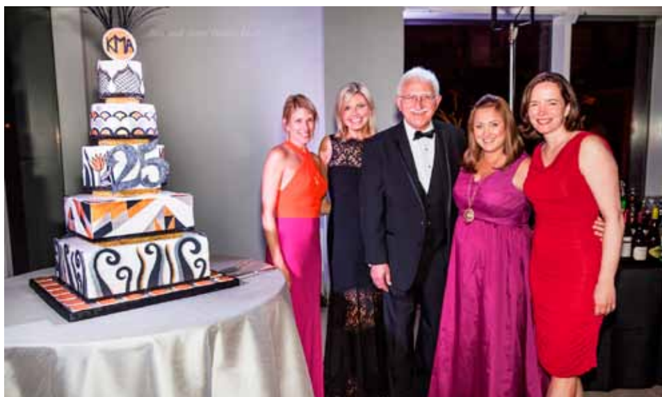
25th Anniversary Gala

In another achievement of an already memorable year, the museum once again achieved accreditation by the American Alliance of Museums (AAM), the highest national recognition for a museum. This is the KMA’s third accreditation, a status it first attained in 1995. In its notification letter, the AAM Accreditation Commission noted that the KMA “demonstrates best, and often exemplary, museum practices in many areas. . . We commend the museum for taking a risk and employing a smart strategy to focus its exhibitions and collections on the art and artists of East Tennessee as a way to strengthen community participation and support. Likewise, new educational programs and free admission show the institution’s commitment to better connect with the regional community.” AAM reaccreditation is a resounding affirmation of the KMA’s strategic direction and the community’s capacity and will to support a first-rate cultural organization. This honor reflects years of hard work and dedication by paid and volunteer staff and extraordinary and sustained commitment