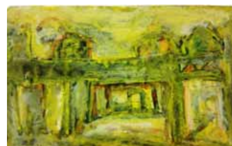
Beauford Delaney (Knoxville 1901-1979 Paris), Untitled (Study for Street Scene) , 1967. Watercolor and gouache on spiral notebook paper, 4 1/8 x 7 inches. Knoxville Museum of Art, purchase with funds provided by the Rachael Patterson Young Art Acquisition Reserve.