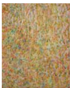
Beauford Delaney (Knoxville 1901-1979 Paris), Scattered Light , 1964. Oil on canvas, 36 5/8 x 28 3/4 inches. Knoxville Museum of Art, purchase with funds provided by the Rachael Patterson Young Art Acquisition Reserve.