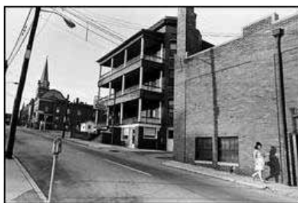
Danny Lyon (Brooklyn, 1942; lives and works in New York), Sunday , Knoxville, 1967. Gelatin silver print, 11 x 14 inches. Knoxville Museum of Art, purchase.