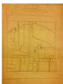
Beauford Delaney (Knoxville 1901-1979 Paris), Untitled (Cityscape) , late 1950s. Pencil on newsprint, 8 x 5 inches. Knoxville Museum of Art, purchase with funds provided by the Rachael Patterson Young Art Acquisition Reserve.