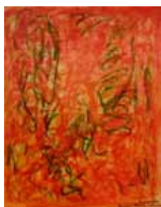
Beauford Delaney (Knoxville 1901-1979 Paris), Untitled (Tuileries, France) , 1966. Pastel on paper, 10 1/2 x 8 inches. Knoxville Museum of Art, purchase with funds provided by the Rachael Patterson Young Art Acquisition Reserve.