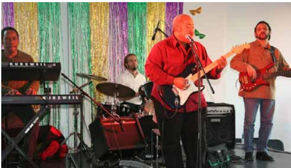
Alive After Five

for early-stage Alzheimer's patients. The KMA was also pleased to bring art programming to a total of six Community Schools, an innovative partnership that provides services and enrichment to children and their families in economically disadvantaged neighborhoods.