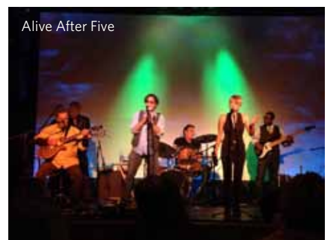
Alive After Five