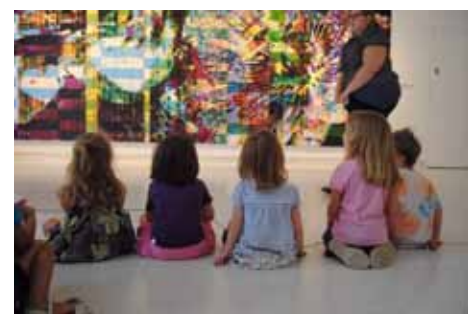
Summer Art Academy 2015

programs presented in the classroom by KMA teachers or by classroom teachers using materials checked out from the museum. The Education Gallery on the lower level featured monthly exhibitions of work by local elementary school students. More than 400 school-age children participated in the KMA Summer Art Academy in the summer of 2014, including 114 who were provided with tuition scholarships. Total enrollment for summer 2014 was, once again, the highest ever. Outside the museum, "Meet the Master" placed certified art teachers in classrooms at no expense to schools. All lessons, based on Higher Ground or current special exhibitions, support Tennessee and national curriculum standards. Ideally, the classroom experience precedes a visit to the museum, with bus travel reimbursed by a special fund established at the museum for this purpose. "ART2GO" travel cases, available free of