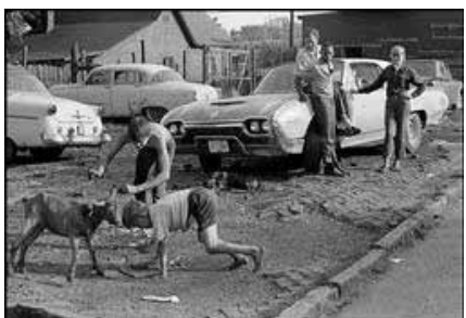
Danny Lyon (Brooklyn, 1942; lives and works in New York), Untitled (Young Boy Fighting "Goat-Dog") , Knoxville, 1967. Gelatin silver print, 11 x 14 inches. Knoxville Museum of Art, purchase with funds provided by Lane Hays.