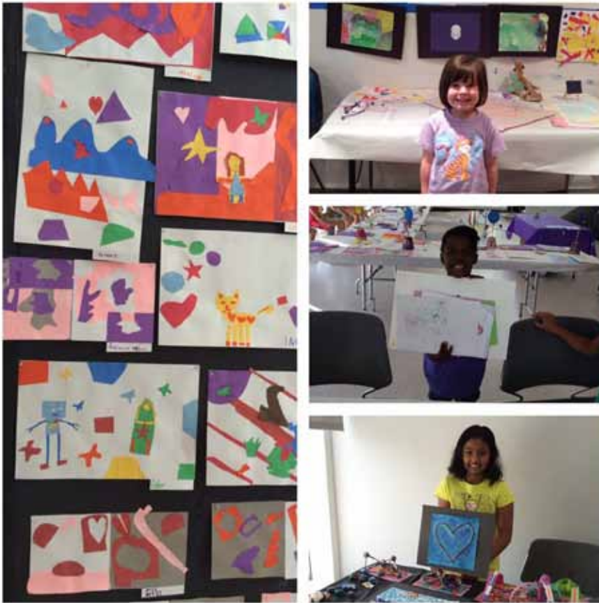
Summer Art Academy 2015

The museum's approximately $1.8 million annual operating budget comes from individual and corporate donors, museum memberships, rental income, local, state, and federal government grants, endowments, and annual fundraising events organized by the KMA Guild. More than 300 volunteers donate in excess of 15,000 volunteer hours each year. The KMA has operated solidly in the black for more than a decade, and is committed to the highest ethical and professional standards. The KMA was accredited by the American Alliance of Museums in 1996 and reaccredited in 2005 and 2015, a distinction shared by fewer than 10% of American museums.