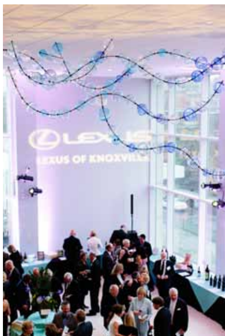
L'Amour du Vin

On top of what was already a busy and productive year, since October 2014 I have served as president of the Southeastern Museums Conference. In that capacity, I was honored to represent the KMA and the Southeastern region on Capitol Hill for the annual American Alliance of Museums Advocacy Day in February and at the AAM annual meeting in Atlanta in April.