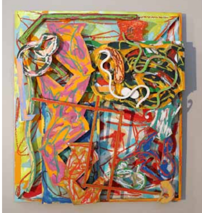
Frank Stella, Shards II , 1982

the museum underwent a comprehensive, top-to-bottom restoration and renovation at a cost of nearly $6 million. The museum's beautiful pink Tennessee marble cladding was cleaned and restored. The entry plaza and third floor terrace were demolished, waterproofed, rebuilt, and elegantly repaved with pink and gray Vermont granite. Visitors can now enjoy beautiful new restrooms and pristine new terrazzo floors on the second and third levels; a renovated and functional catering kitchen can better support museum events and outside rentals. The new North Garden has been handsomely articulated with new retaining walls, terraces, and ramps, and planted with native trees, shrubs, and ground cover. These vital repairs and upgrades, made possible by the success of the 25 th Anniversary Campaign, will ensure the preservation and enjoyment of Edward Larrabee Barnes' modernist masterpiece as it moves into its second quarter-century. The campaign also supported endowment enhancement and the establishment of a dedicated art acquisition fund.