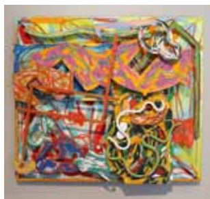
Frank Stella (Malden, Massachusetts, 1936; lives and works in New York), Shards II , 1982. Acrylic and oil stick on etched, cut and assembled aluminum, 40 x 45 x 6 inches. Knoxville Museum of Art, gift of June and Rob Heller.