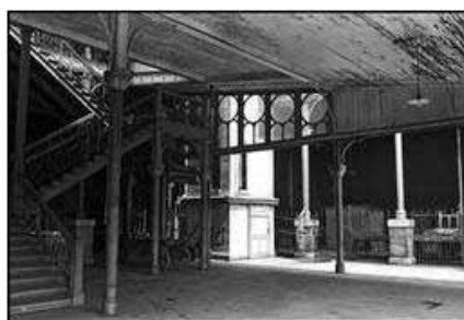
Danny Lyon (Brooklyn, 1942; lives and works in New York), Untitled (L & N Station) , Knoxville, 1967. Gelatin silver print, 11 x 14 inches. Knoxville Museum of Art, purchase.