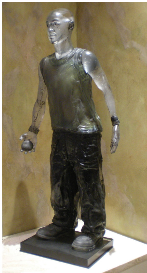
Oben Abright, Qraun Series , 2005. Molded blown glass and oil paint, 37.75 x 14.25 x 9.5 inches.