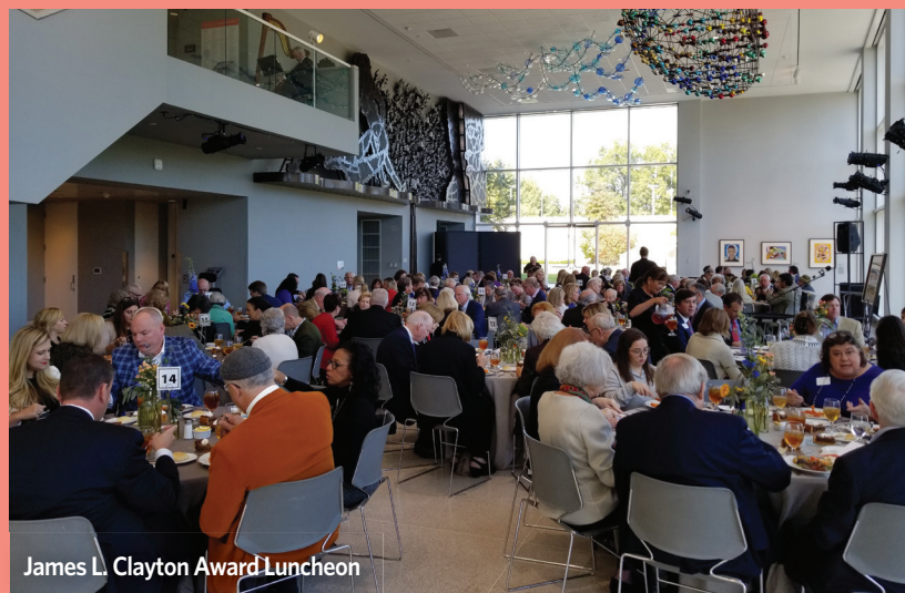
James L. Clayton Award Luncheon