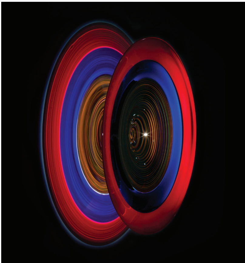
Stephen Rolfe Powell, Funneling Salacious Mania , 2013. Blown and hot-formed glass, 27.5 x 27.5 x 8.5 inches.