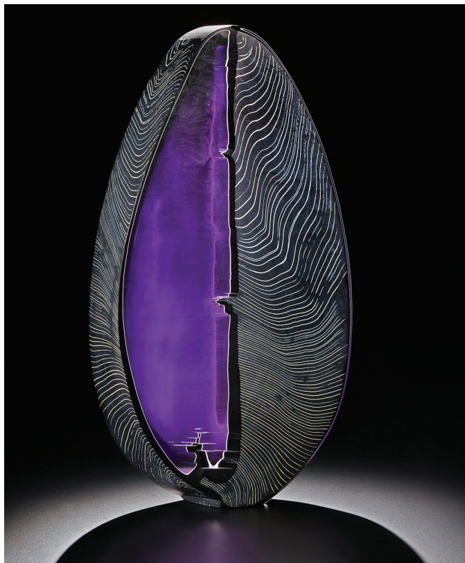
Ethan Stern, Lunar Light Long , 2015. Blown and wheel-cut glass, 22.5 x 12 x 3 inches.