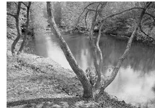
(top left) Ansel Adams (1902-1984) Mt. LeConte, Autumn, Great Smoky Mountains National Park, Tennessee, 1948