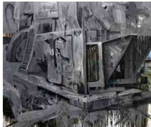
Leonardo Silaghi (Romanian, born 1987), #1210610 , 2012, Oil on linen, 75 x 94 1/2 inches. Gift of the Marc and Livia Straus Family Collection, 2013