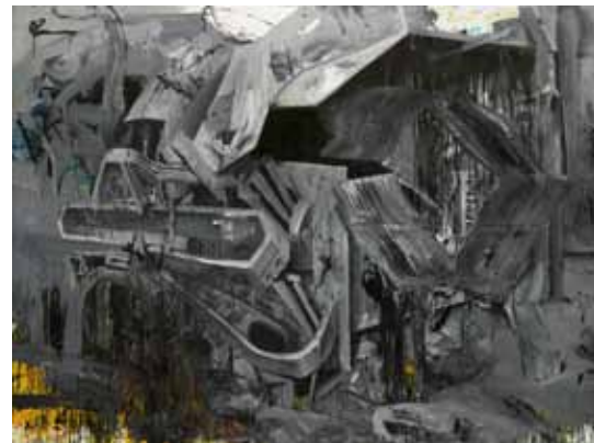
Leonardo Silaghi (Romanian, born 1987), #1313203 , 2013, Oil on canvas, 90 1/2 x 120 inches. Knoxville Museum of Art purchase, 2013