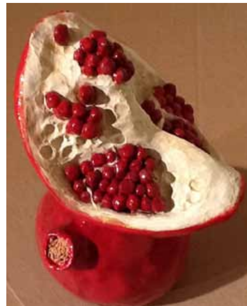
Molly Landmesser, Pomegranate , Best Ceramics, 2012