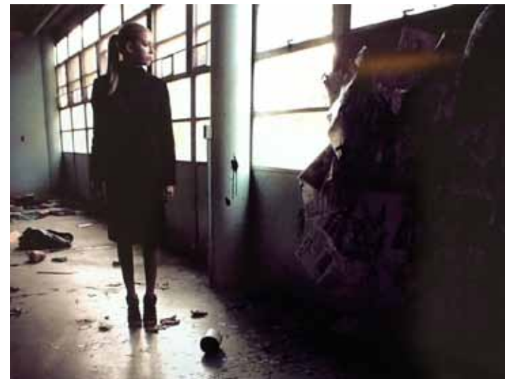
Caroline Trotter, The Closing of Lakeshore: Left Behind , Best Photography, 2012