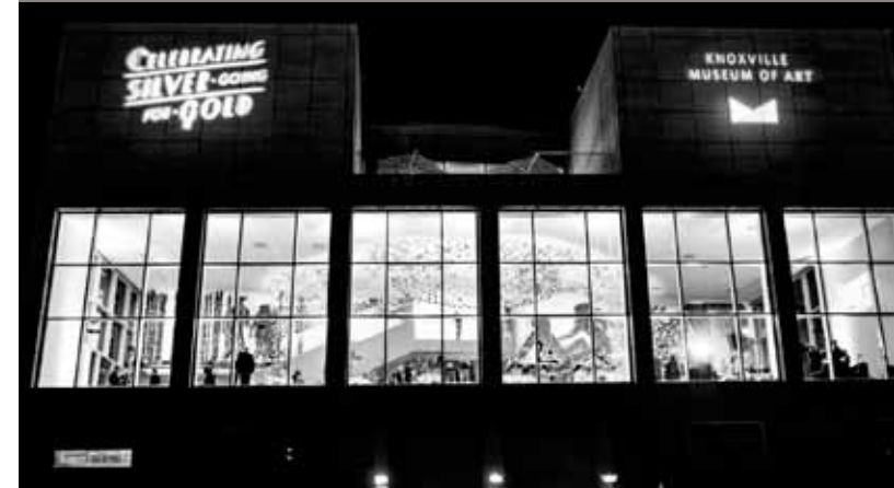
The KMA aglow inside and out for Celebrating Silver, Going for Gold .