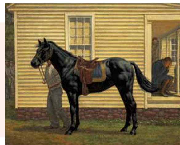
General Stoneman's Horse, Lemuel Poole Hoole, 1864. Oil on canvas, 16 x 20 inches