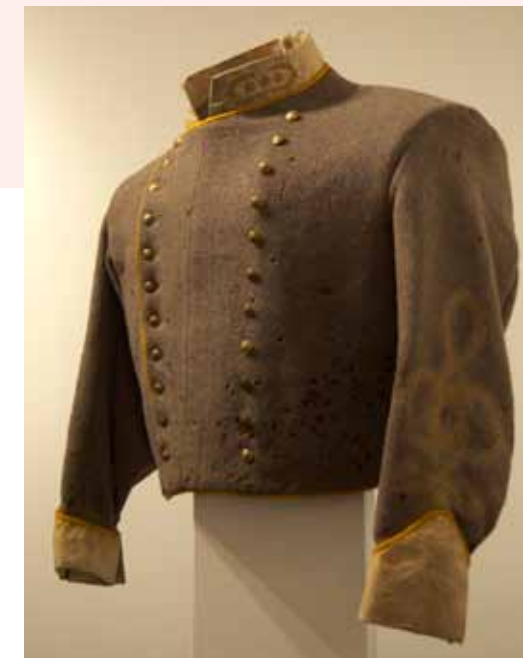
General Alfred Iverson's Cavalry Jacket, Hand-tailored in Rome, Georgia, 1864. Wool, brass, gold trim