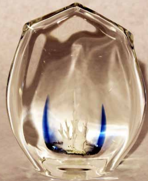
Dominick Labino, Sea Kingdom Series , 1983. Hot-worked glass, 5 3/4 x 4 5/8 x 2 1/4 inches, Knoxville Museum of Art, gift of Mary Hale Corkran in memory of her husband Blair.