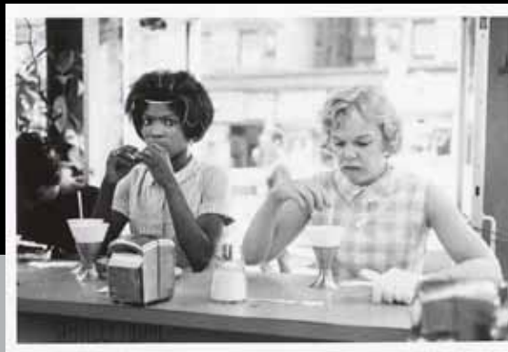
(bottom) Lee Friedlander, Texas , 1965, gelatin silver, 8 1/2 inches x 12 7/8 inches, collection of the Museum of Photographic Arts; Museum purchase with funds provided by MoPA Photo Forum