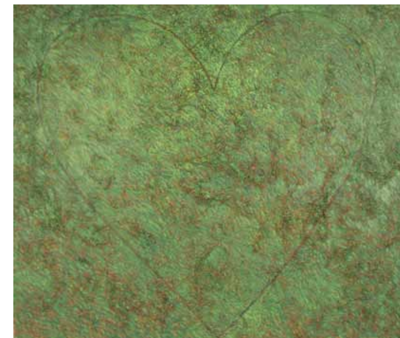
Jim Dine (Cincinnati 1935; lives and works in New York), Green Picture in My Meadow , 1971. Acrylic and straw on canvas, 72 1/4 x 84 1/2 inches, Knoxville Museum of Art, gift of June and Rob Heller, 2014