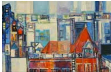
Robert Birdwell (Knoxville 1924; lives and works in Knoxville), Face of a City, 1957 . Oil on canvas, 32 x 40 inches, Knoxville Museum of Art, gift of the Knoxville Arts Center, 1986