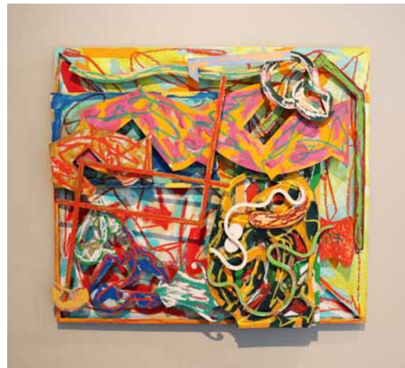
Frank Stella (Malden, Massachusetts, 1936; lives and works in New York), Shards II , 1982. Acrylic and oil stick on etched, cut and assembled aluminum, 40x45x6 inches, Knoxville Museum of Art, gift of June and Rob Heller, 2014