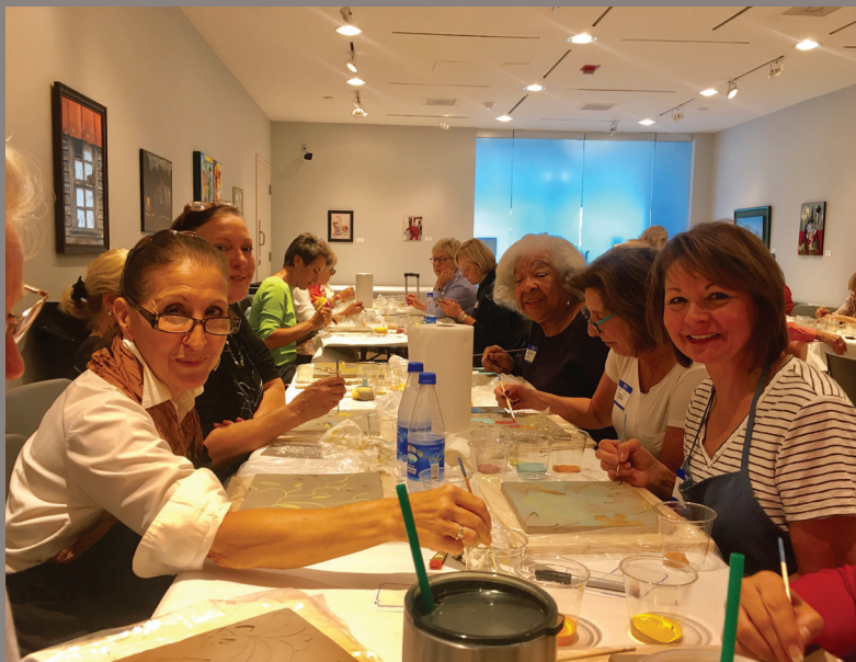
Members glazing tiles for ETCH in the Kramer Room at the Knoxville Museum of Art