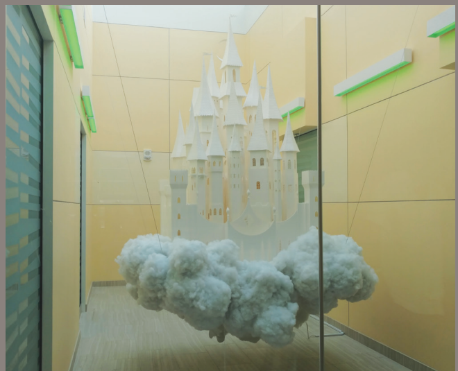
Pile of Coats paper sculpture installation Just Imagine in the NICU Light Court