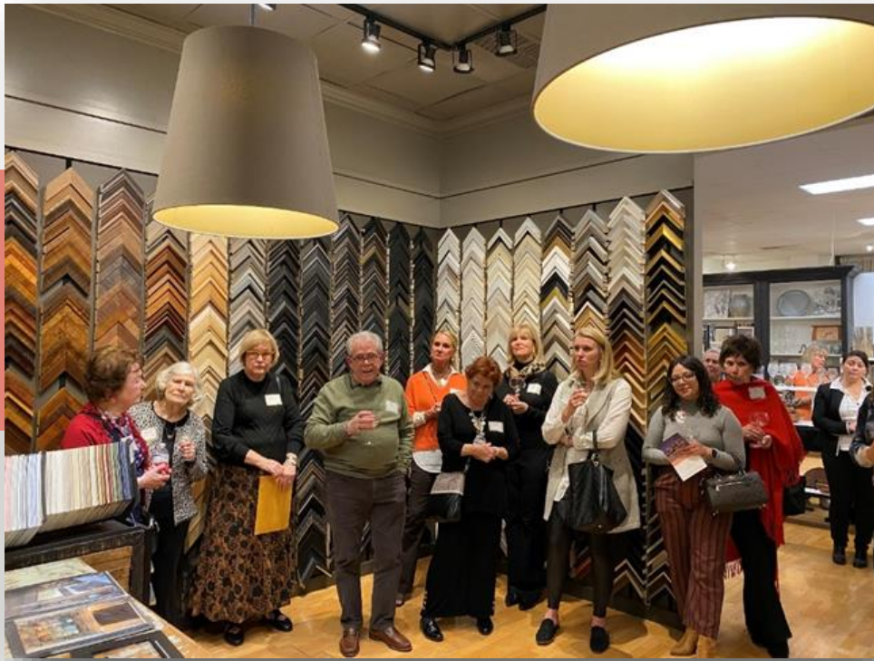
Guests gathered in the Framery room to learn about new framing ideas