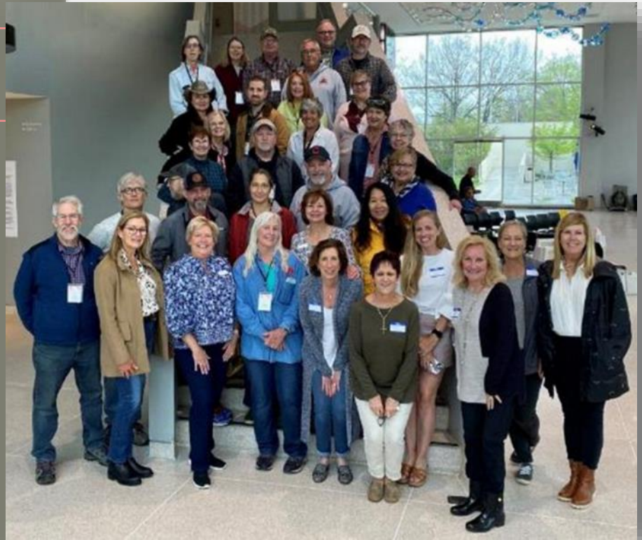
AOL-22 Artists and a few committee folks at the KMA to kick off the week!