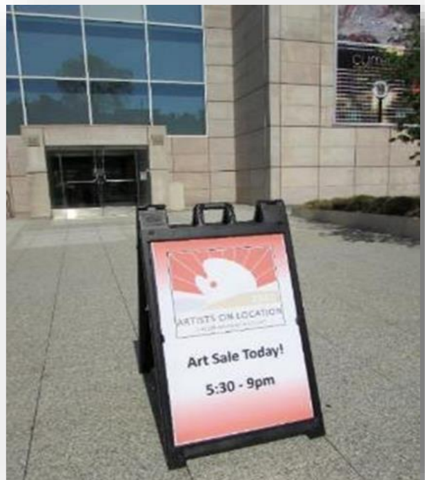
Artists on Location a plein air event, April 18-23, 2022