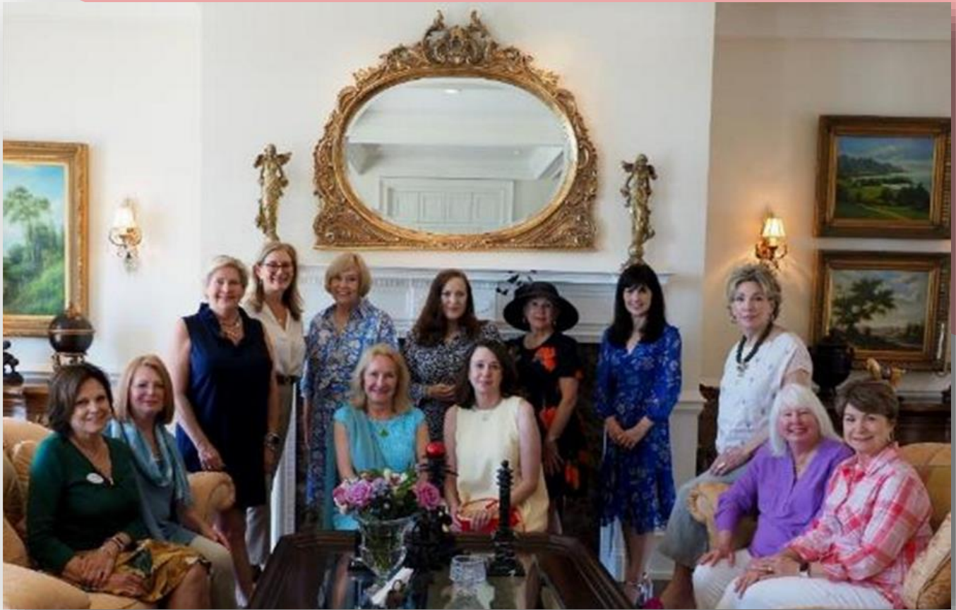
A few Guild Board Members from 2021-22 and 2023